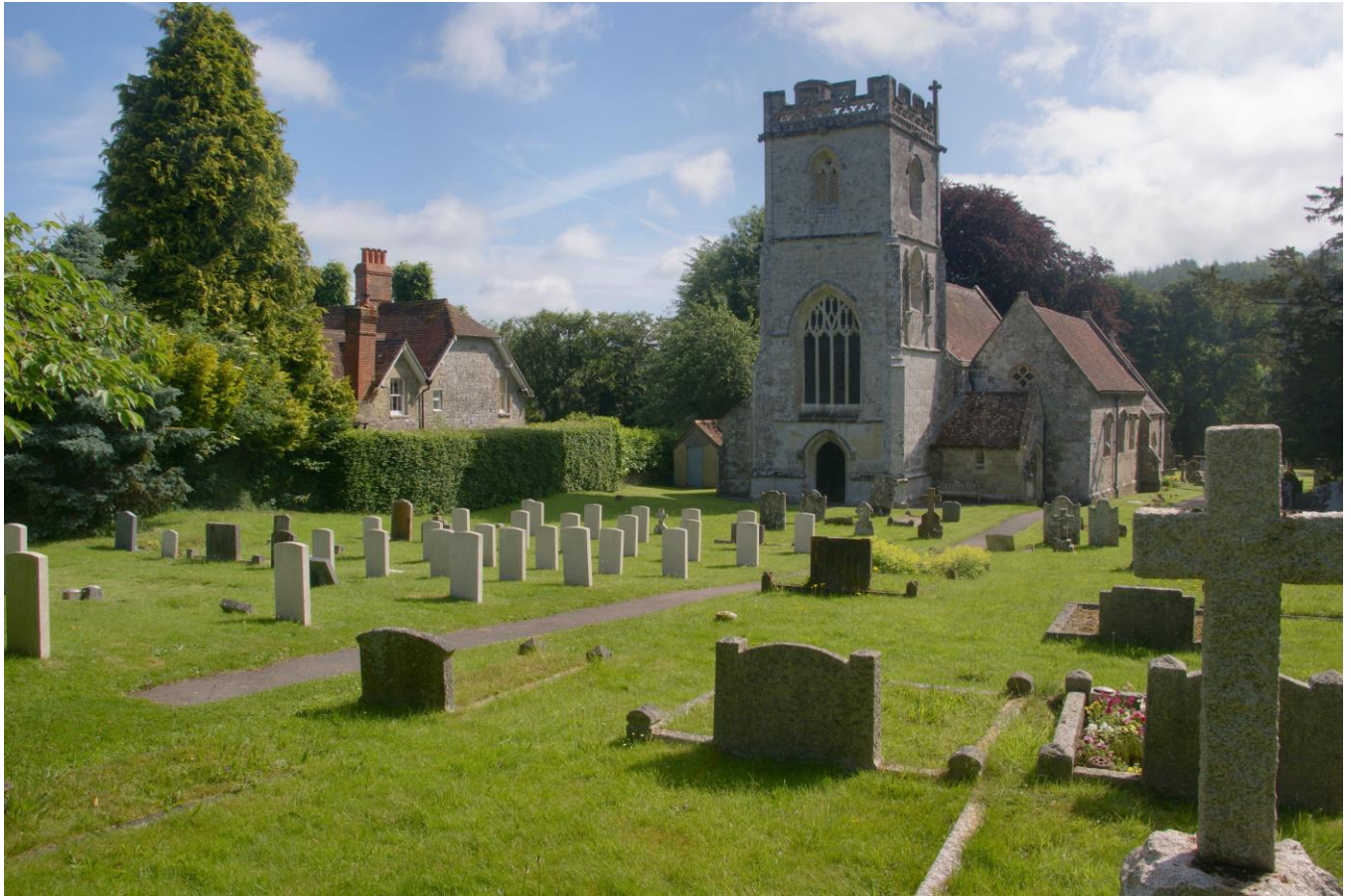
St George's Churchyard, Fovant – War Graves at rear